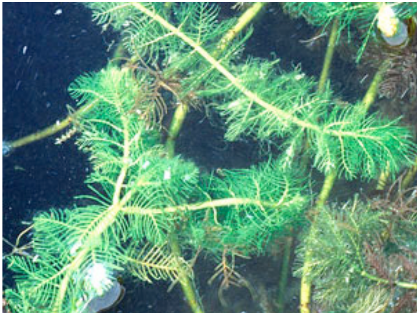
Eurasian Water Milfoil

Second round of treatment follows 77% successful first effort in 2011 in Wilson Lake